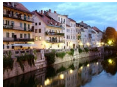
Ljubljana Riverside walk

Researchers will also have a special opportunity to attend the Meet the Editor session and learn how best to prepare their research results for a broad exposure and international publishing. On the other hand, the